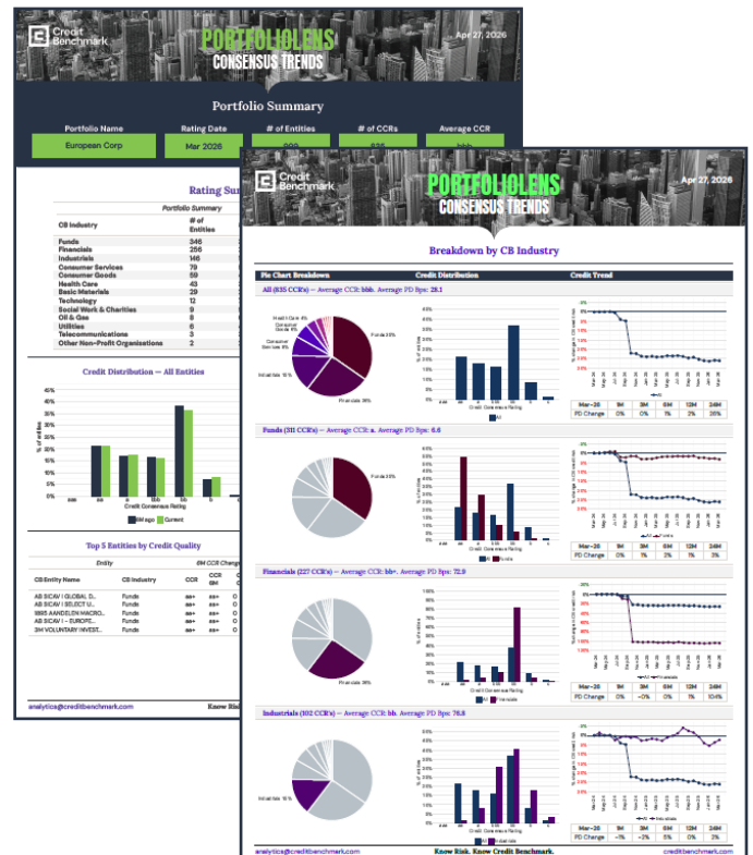
Example PortfolioLens Report: European Corporates