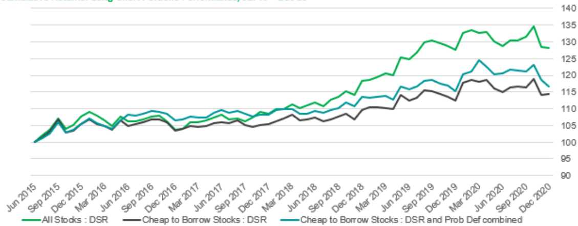
Cumulative Returns: Long-Short Portfolio Performance, Jul 15 – Dec 20